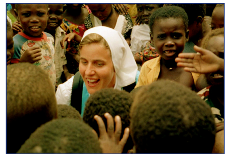
A Salesian missionary sister

be in good working order—not necessarily perfect, but without major problems which would make it impossible or extremely difficult to think and choose rightly. Of course, all the good we do comes from Christ, and Christ can make up for any deficiency we have. However, the Church has always taught that we should not “sit back” and count on Christ to overcome all our problems. We need to be doing what we can to put our mind and will in good working order. Also, we cannot give what we do not have. If I do not understand a math rule, I cannot teach it to someone else. Likewise, if a religious cannot bear to be silent, he will not be able to support his fellow religious in their