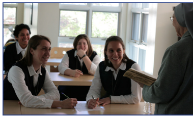
Young women taking classes in preparation to become sisters