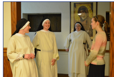
Contact with religious communities is the best way to get to know which orders you might fit into.