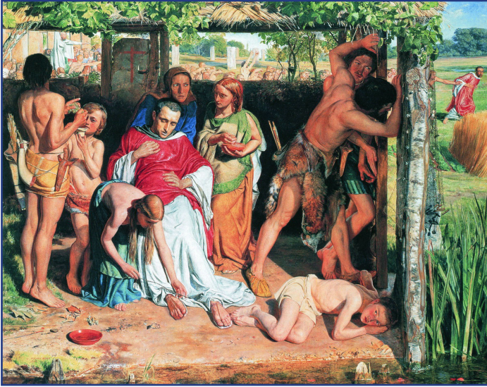
“A Converted British Family Sheltering a Christian Priest from the Persecution of the Druids” by William Holman Hunt