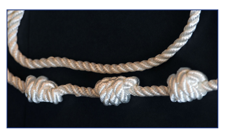
Three knots symbolize the three vows that religious make.

When explaining, show your knowledge of religious life. The more creative your answer, the better!