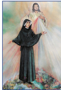
St. Faustina had visions of Jesus. This painting was displayed at her canonization in the year 2000.

Write a psalm or poem about heaven and being in God's company. Include how you think heaven would feel and what it would look like.