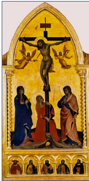
"Crucifixion," by Nardo di Cione