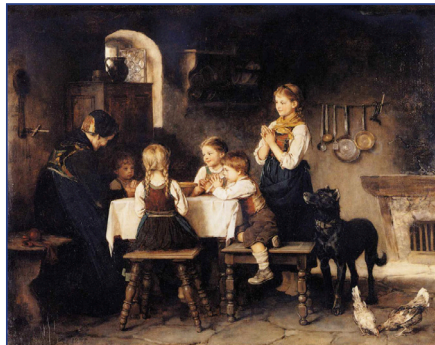
"Grace Before Meal" by Franz von Defregger