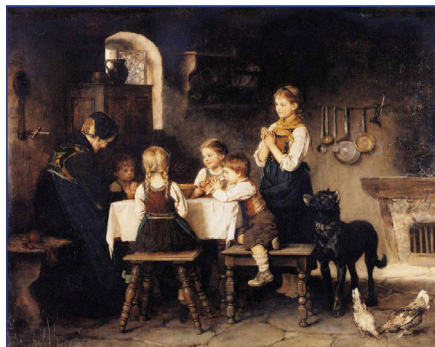
“Grace Before Meal” by Franz von Defregger