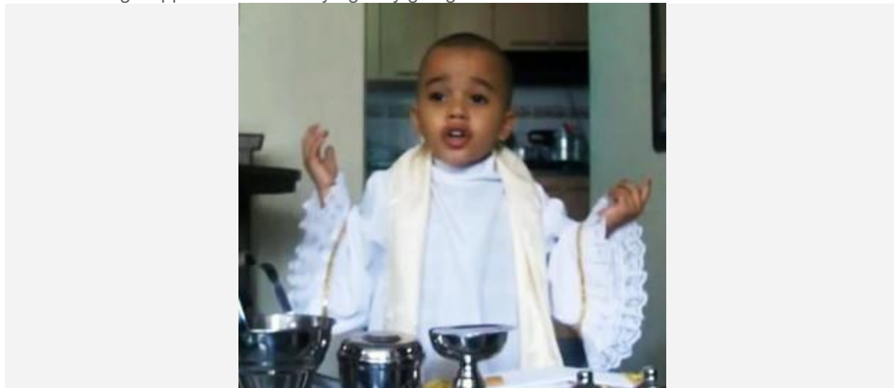
A little boy pretends to celebrate Mass.