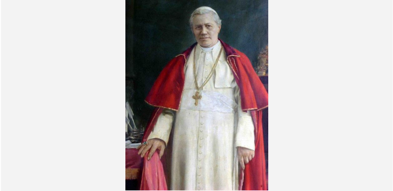
Pope Saint Pius X