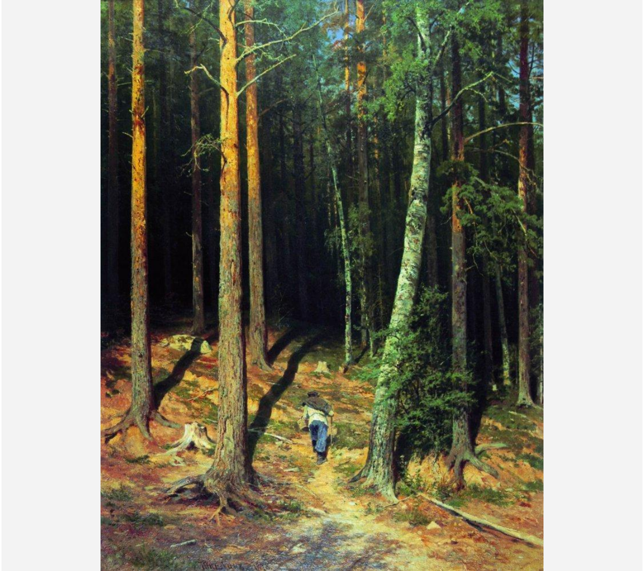
The father ran to find his children. "Pine Forest," Ivan Shishkin, 1878