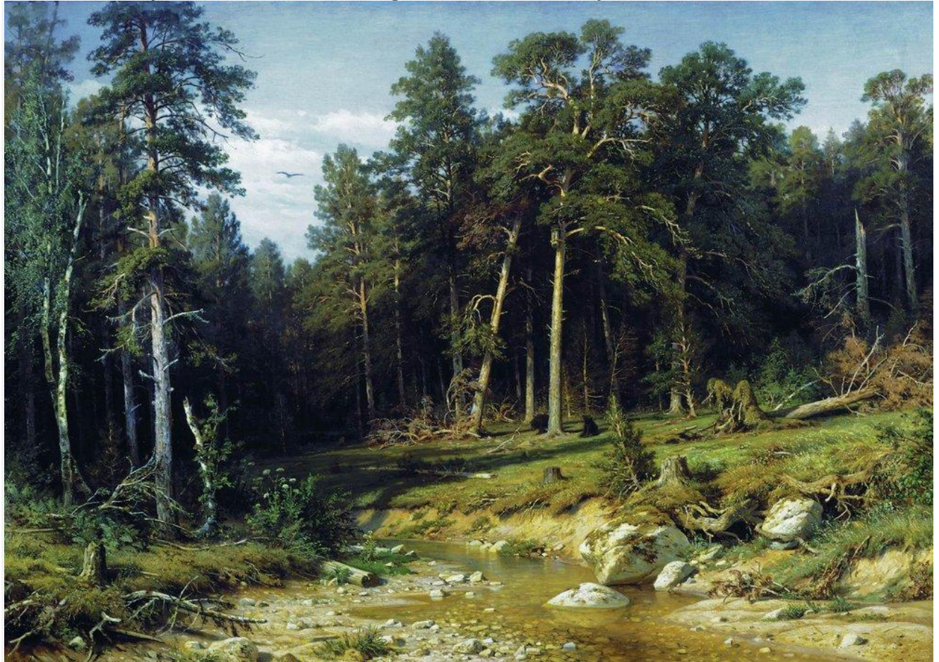
The woods were fun at first, but soon the children were lost. "Pine Forest in Vyatka Province," Ivan Shishkin, 1878

"No," said the boy. "Our Father will never forget us, and he will surely come find us."