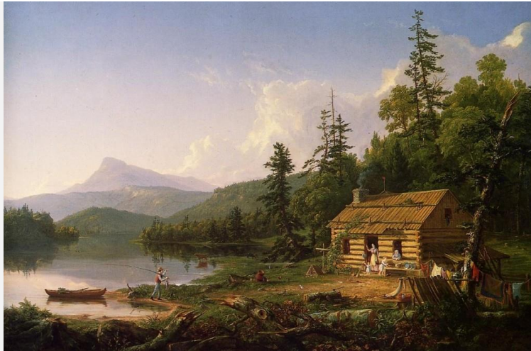
The children lived with their mother and father in a beautiful home. "Home in the Woods," Thomas Cole, 1847

Once upon a time there were two little children, a boy and a girl, who had a very special home. Their home was full of sunshine and flowers. Their mother and father always gave them good things to eat, and happiness filled the home. To the boy and girl, however, the best thing about their home was their Father. He was the happiest father you ever met, and his eyes would twinkle like real stars when he looked at his children. He loved to carry his little daughter on his shoulders and let her pick cherries from the trees. He loved to toss his little boy way high up in the air and catch him. The two children loved their home and their Father.