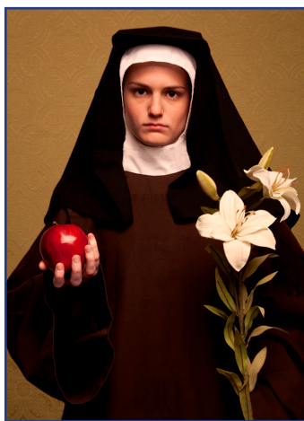
St Theresa Benedicta of the Cross