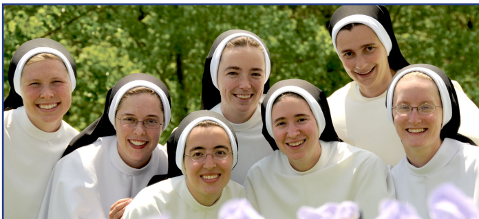
Dominican Sisters of Saint Cecilia http://nashvilledominican.org

I began to pray even more, making a holy hour each day. I felt that God wanted me to be in St. Catherine's order. It is funny now to remember coming home from the January vocation retreat to the Diocese of Arlington and telling the priest at my parish, "I want to be a Dominican, but I am not sure where!" I had a hundred concerns about looking in the direction of Nashville. I was quieter than most of the sisters I had met, and I wasn't sure that I wanted to teach. But the more I prayed the more I felt that God was calling me south. I made a retreat at the Motherhouse and saw my attraction for the life expanding. I then returned a month later, this time convinced that this was where I belonged. I was accepted on Palm Sunday and spent the spring and summer in happy anticipation.