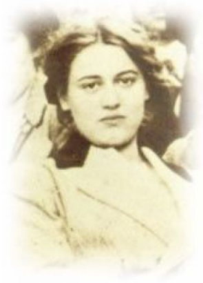
Edith Stein as a young woman

The Nazis invaded Holland and expelled all Catholics of Jewish background, including Teresa Benedicta who was put to death in the gas chambers at Auschwitz on August 9, 1942. Her writings and her prayerful love for people in the midst of her sufferings became widely contemplated. She was canonized by Pope John Paul II in 1998.