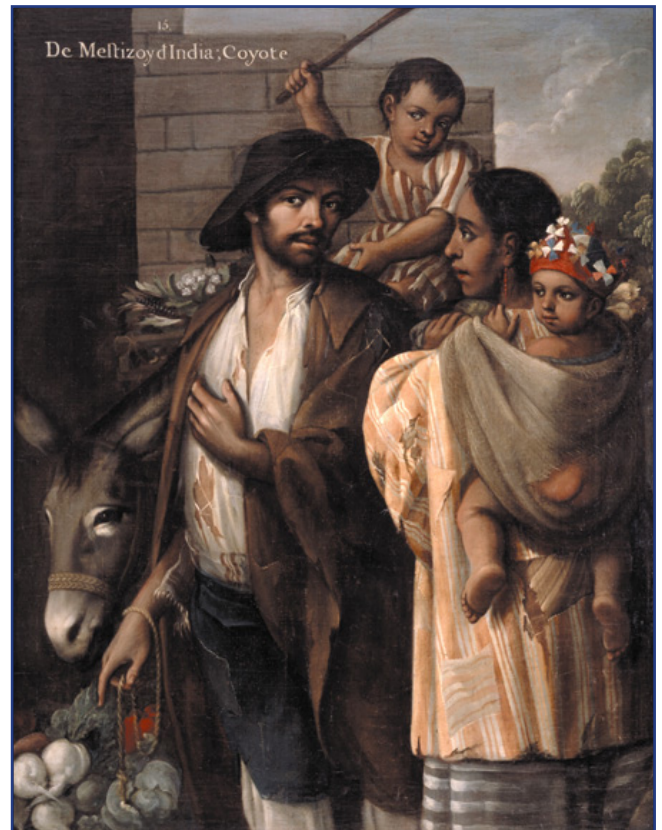
Casta Painting: No. 15. From Mestizo and from Indian; Coyote by Miguel Cabrera