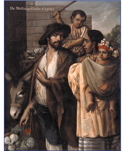
Casta Painting: No. 15. From Mestizo and from Indian; Coyote by Miguel Cabrera