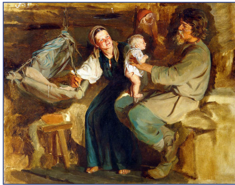
Parental Joy by Kirill Vikentevich Lemokh