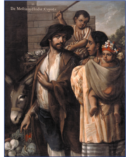
Casta Painting: No. 15. From Mestizo and from Indian; Coyote by Miguel Cabrera