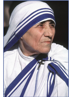
Blessed Teresa of Calcutta NEW DELHI, INDIA: (FILES) This undated photo shows Mother Teresa. Mother Teresa will be beatified, 19 October 2003, in a ceremony in St Peter's Square, Vatican. The beatification ceremony is the penultimate step to being canonised a saint and has been the shortest in modern history. Following the beatification, a second miracle has to be verified by the Vatican before Mother Teresa can be proclaimed a saint.

I am praying for God's blessing on all who are taking part in the Fourth World Conference on Women in Beijing. I hope that this Conference will help everyone to know, love, and respect the special place of women in God's plan so that they may fulfill this plan in their lives.