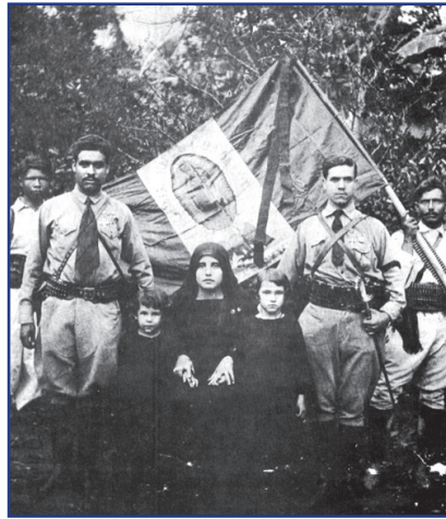
Cristeros with the religious sister they were protecting.

The 1917 Constitution in Mexico passed a number of anti-Catholic laws. These laws were not enforced right away, but in the late 1920s under President Plutarco Calles, punishment suddenly came for celebrating mass, wearing a religious habit or having a religious house, and churches were closed. Thousands of priests and religious were exiled or even killed. Religious were forced to leave the country or hide in the homes of families. And families stepped forward.