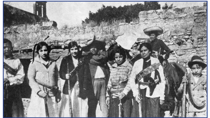
The Feminine Bridage of St. Joan of arc consisted of women who fought to protect priests, religious, and faithful members of the Church.