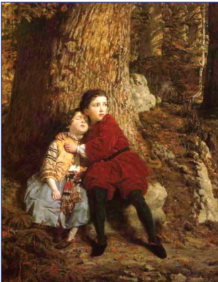
3 The children fell asleep under a tree. “Children in the Wood” - Charles Lucy, 1859

“No,” said the boy. “Our Father will never forget us, and he will surely come find us.”